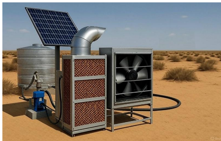
Figure 3. Solar-powered evaporative cooling unit without a pump

Capillary rise is a natural process and practically does not require electrical energy. Small solar panels will be sufficient for the fan. The removal of water molecules from the surface during evaporation leads to heat absorption; in a dry climate, especially in the Aral Sea region, this is very effective. Since the evaporation temperature of salt water is lower, the cooling rate increases again. Crystallization of salt changes the properties of the water surface and further activates the evaporation process. The structure of the fabric, the density of the fibers, and the material strongly influence the rise of water [7]. Although a solar-powered, salt water-based, pumpless evaporative cooling unit is an innovative and power-saving technology, it has a number of advantages and disadvantages (Table 1).