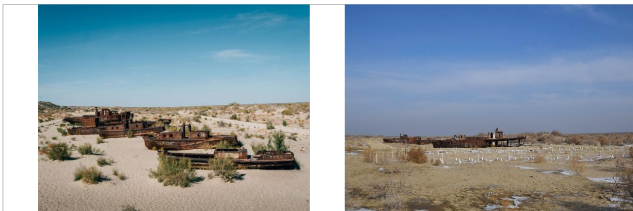
Figure 2. Desertification process and shipwrecks due to the drying up of the Aral Sea

In such conditions, traditional air conditioners require heavy electricity and are not practical in areas with weak infrastructure. Therefore, the application of passive evaporative cooling technology based on solar energy, operating without a pump, in the Aral Sea region is considered an optimal and economically correct solution.